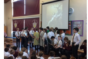
Year 4: Garden of Gethsemane