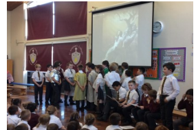
Year 6: The Stations of the Cross