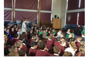
Year 5: The Last Supper